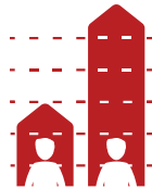
Population of the First 13 States and Their U.S. House of Representatives Seats